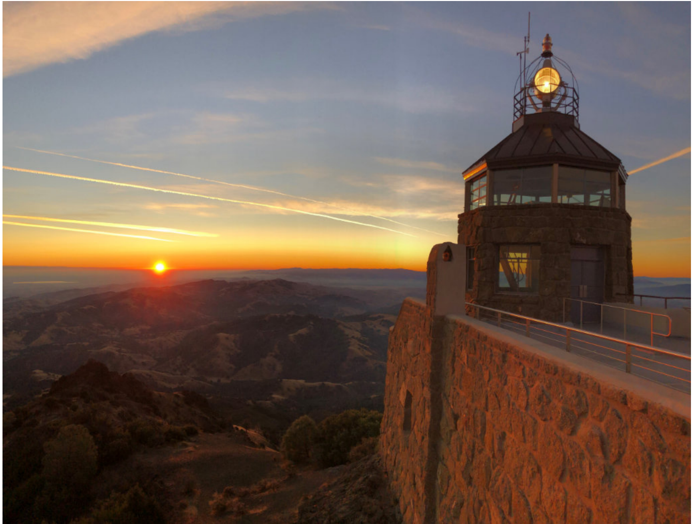
Beacon at the top of Mount Diablo.